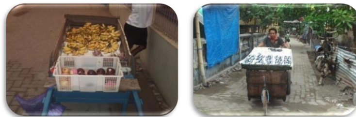
Figure 2. The wagon traders ( pa'lili ) are selling their products.

computer and furniture. The easiness in transportation to cross the island allows fishermen to sell their fishing products to Makassar, Maros and Pangkep. The result for this situation is that fishermen no longer sell their product in their own island (Figure 1).