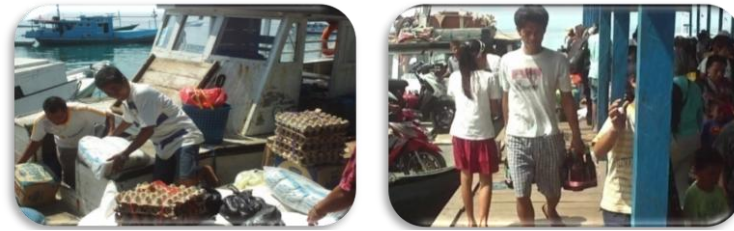
Figure 1. Loading activities at BLI Port.